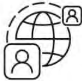
e-Posters & Abstracts